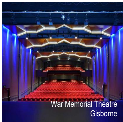
War Memorial Theatre Gisborne