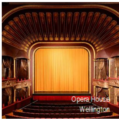
Opera House Wellington