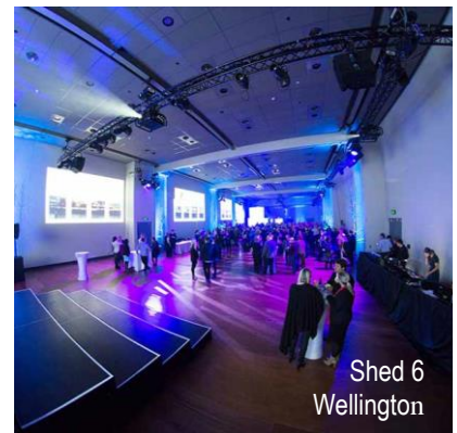
Shed 6 Wellington